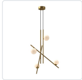
CH89832-BG/GO Brushed Gold/Glossy Opal Glass