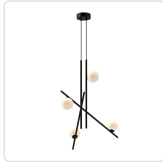
CH89832-BK/GO Black/Glossy Opal Glass